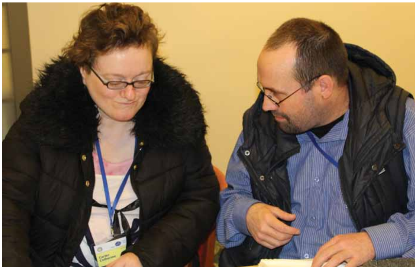
Table 9: We Asked Families: What is needed for you to support your family member to make his/her own decisions?