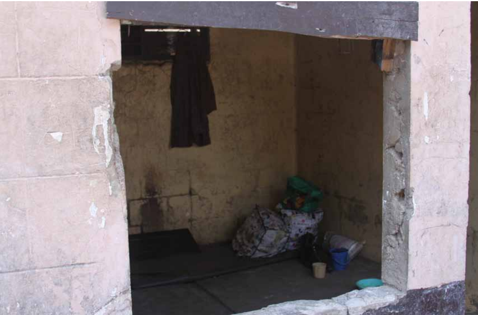
(above) One of the dormitories in the Special Ward at Accra Psychiatric Hospital, where the courts referred people with mental disabilities who had committed crimes.