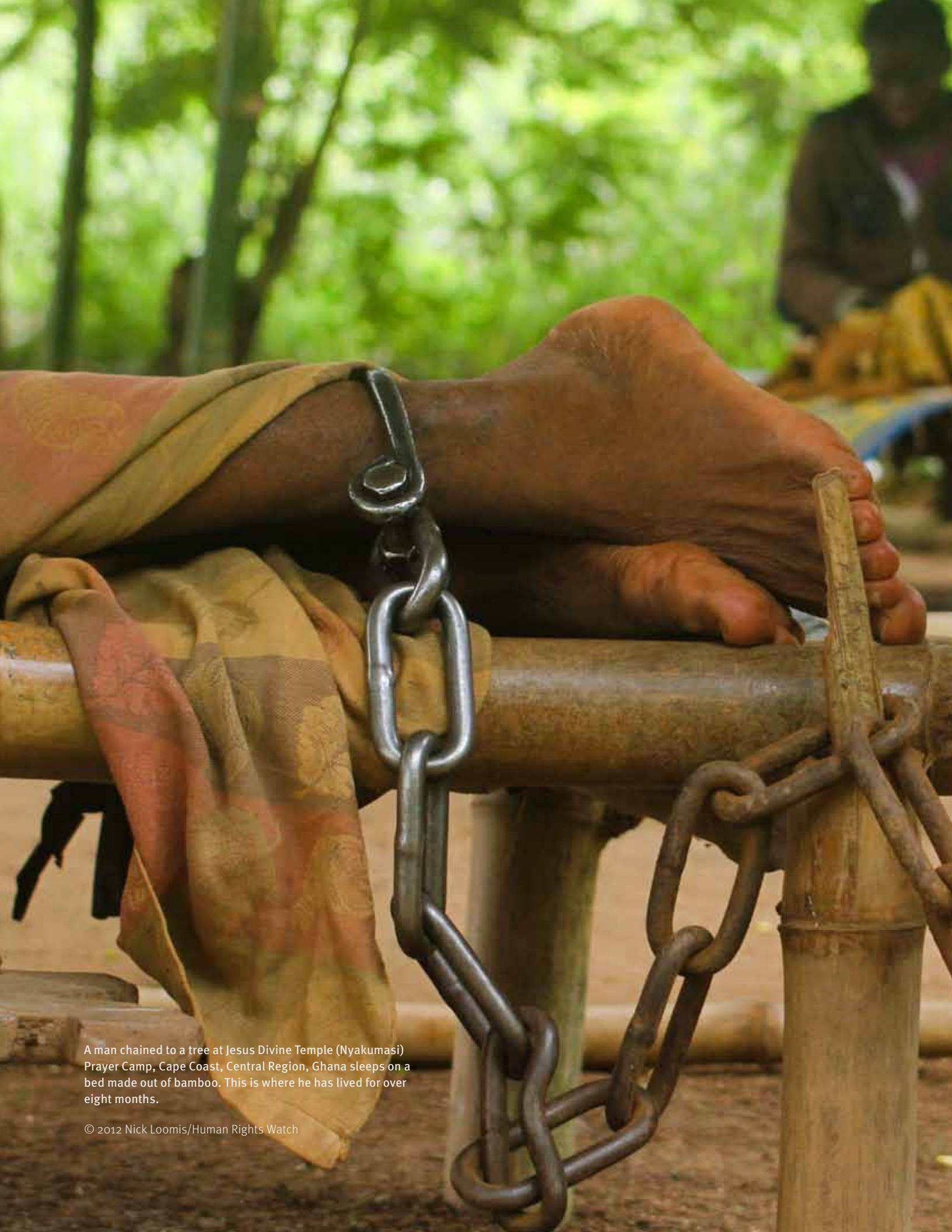
A man chained to a tree at Jesus Divine Temple (Nyakumasi) Prayer Camp, Cape Coast, Central Region, Ghana sleeps on a bed made out of bamboo. This is where he has lived for over eight months.