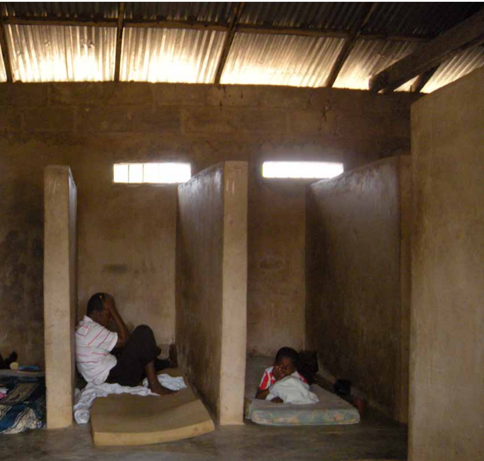
At Heavenly Ministries Spiritual Revival and Healing Center (Edumfa Prayer Camp), some people with presumed mental disabilities lived in buildings with cubicles for each resident and were chained to walls. They could not leave the cubicles without permission of the staff at the prayer camp.