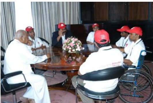
Leonard Cheshire Disability Young Voices members meet with the Prime Minister of Sri Lanka.

One of the real advantages that research gives is the ability to open up dialogue with decision-makers. Awareness-raising can get an issue more prominently into the public eye, but if you want people to make changes you have to provide them with some evidence as to why change is needed.